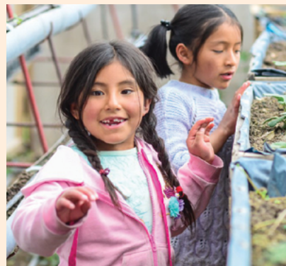
Kiara and Urpy enjoy gardening in the greenhouse made possible by Cass and Old Dog Galloway's generosity.