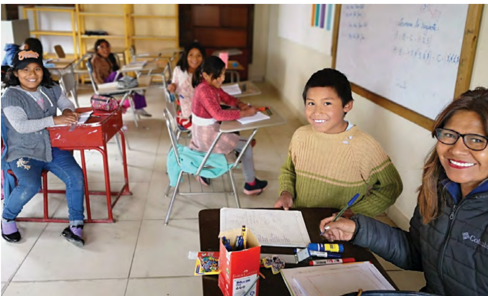
Kids are enjoying school at Casa Chapi before school closures, March 2020.

Our Peru staff is already preparing to welcome the kids back to campus! We can't wait to show you pictures of your kids returning to the beautiful campus in Chivay.