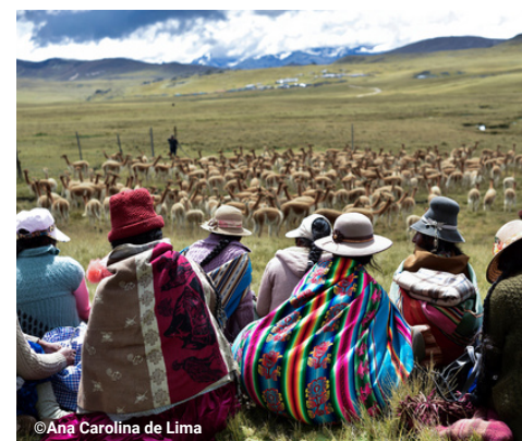
Chaccu - Picotani - April 2019