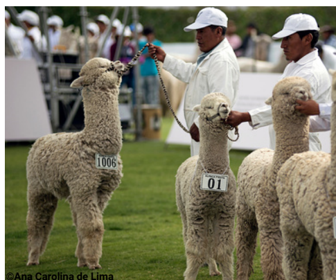
See touch and feel Peru's finest, Suri and Huacaya at the International Alpaca Fiesta Competition