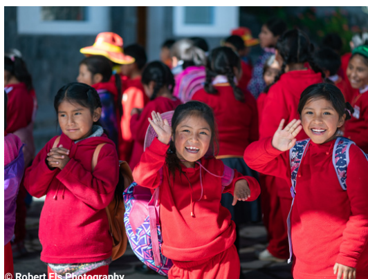
Casa Chapi Kids November 2023